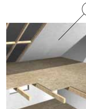
NEW OSB Firestop Cladding in public buildings with increased fire regulations