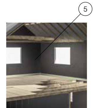
NEW OSB Airstop Used in construction of modern low-energy passive housing